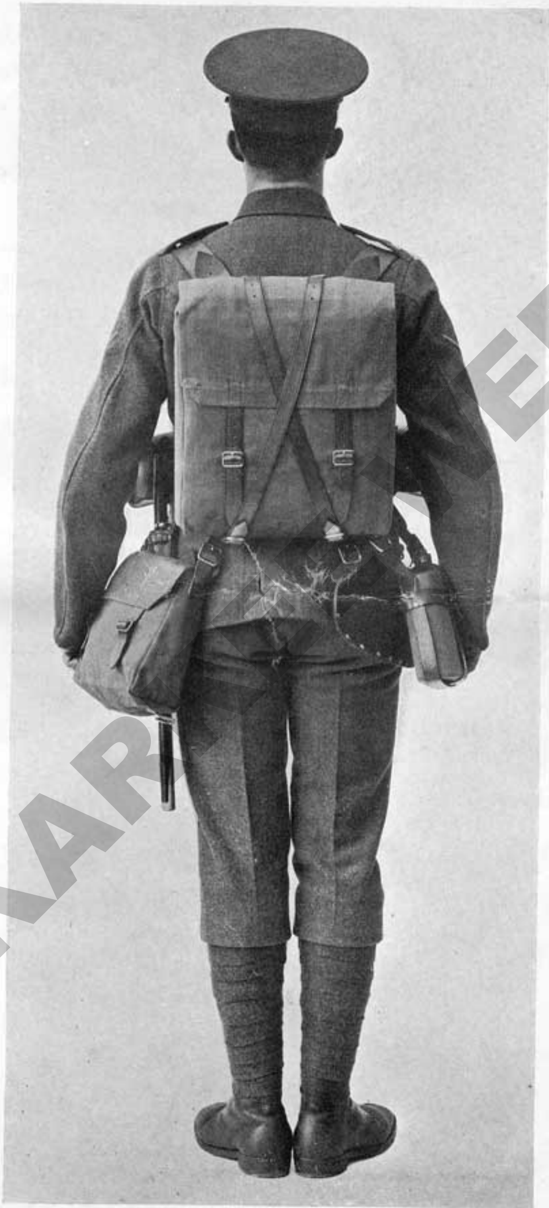
COMPLETE EQUIPMENT. BACK VIEW.