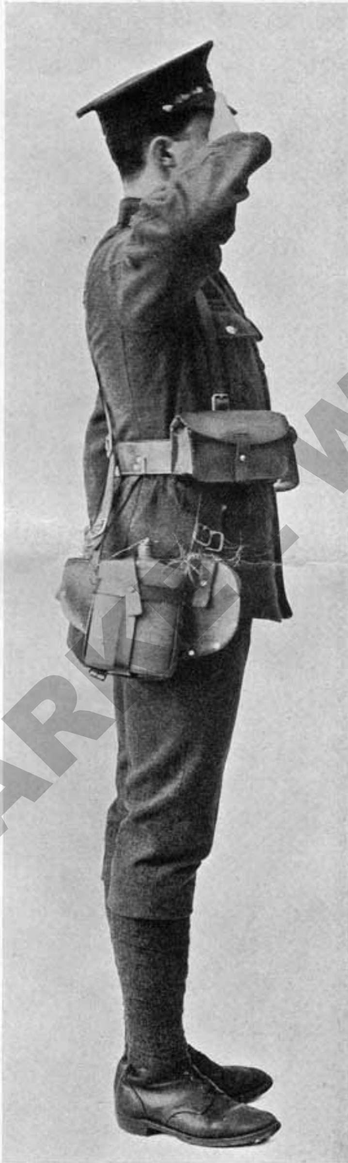
MARCHING ORDER EQUIPMENT, WITHOUT PACK.