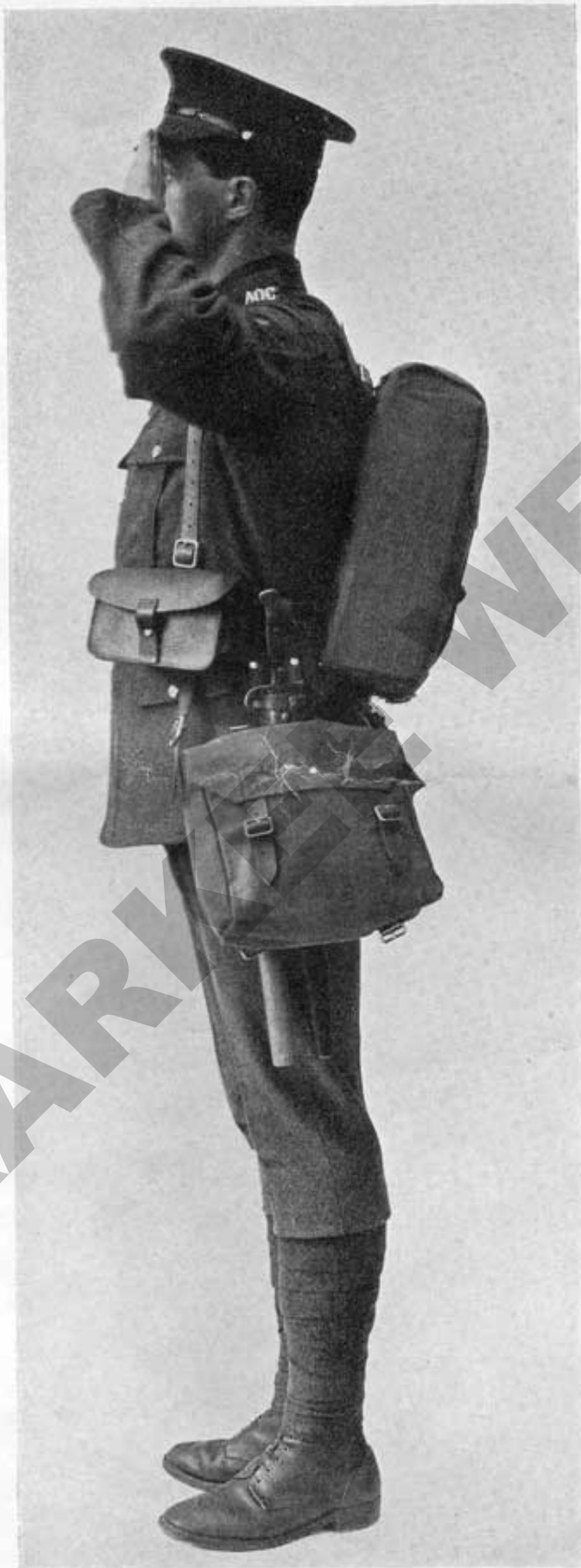
COMPLETE EQUIPMENT. SIDE VIEW.