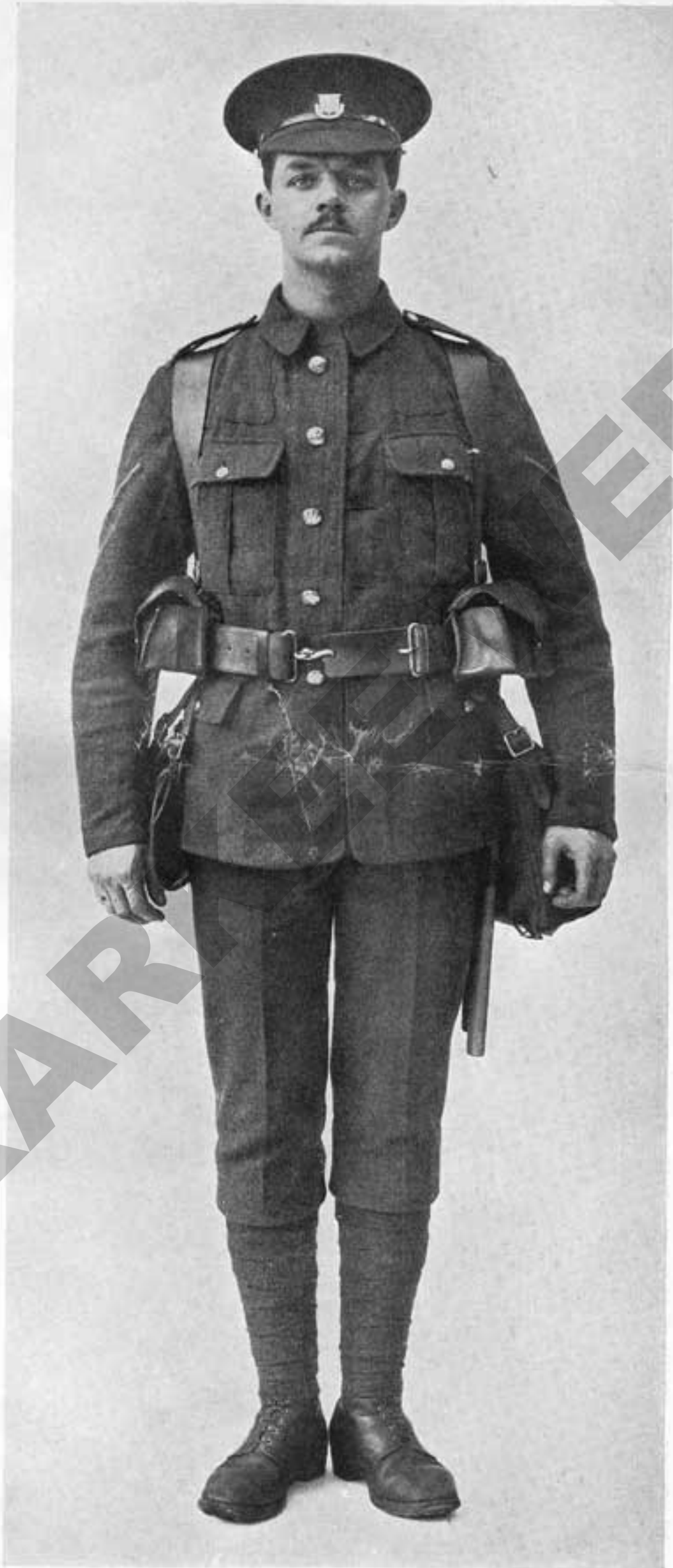
COMPLETE EQUIPMENT, SHOWING EXTENSION OF WAIST BELT.