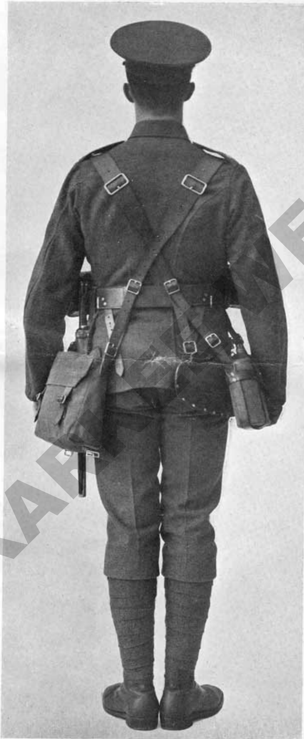
MARCHING ORDER EQUIPMENT, WITHOUT PACK.