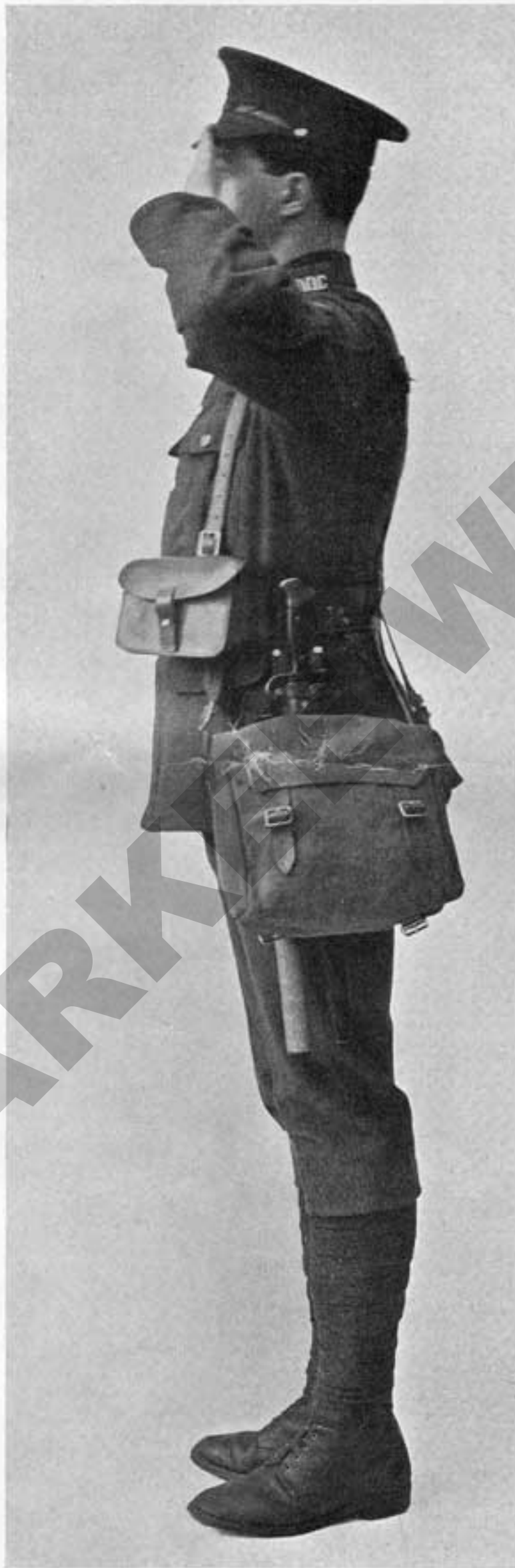
MARCHING ORDER EQUIPMENT, WITHOUT PACK.