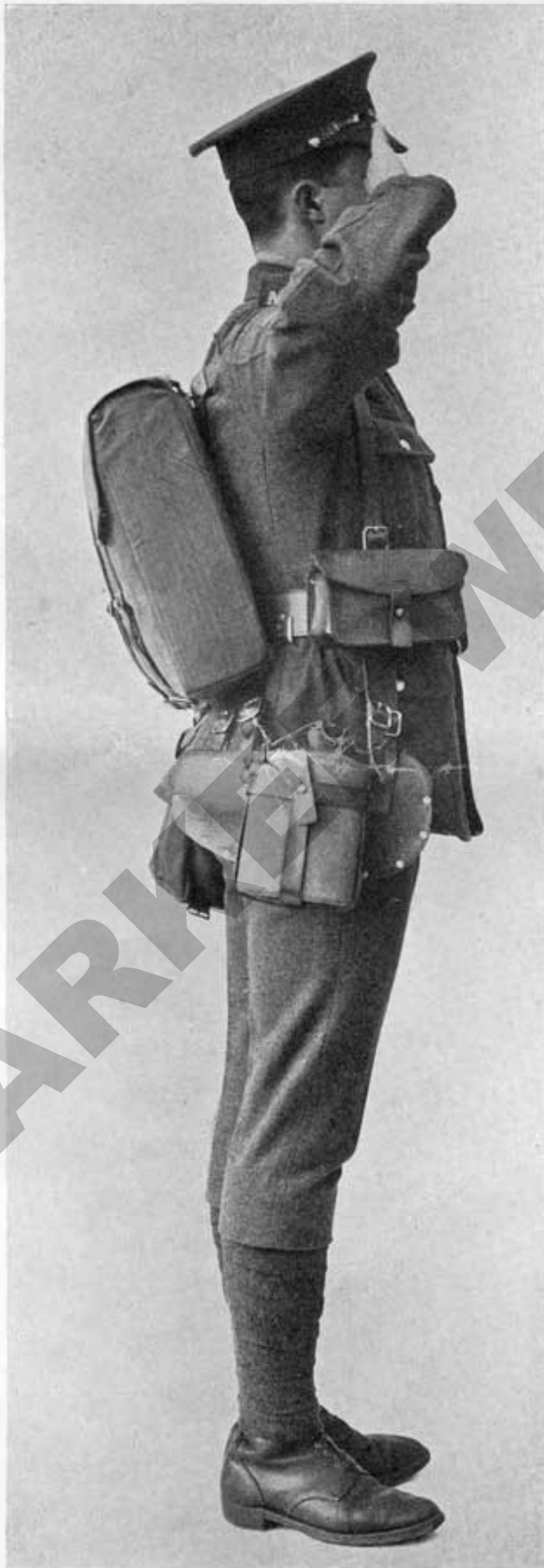
COMPLETE EQUIPMENT. SIDE VIEW.