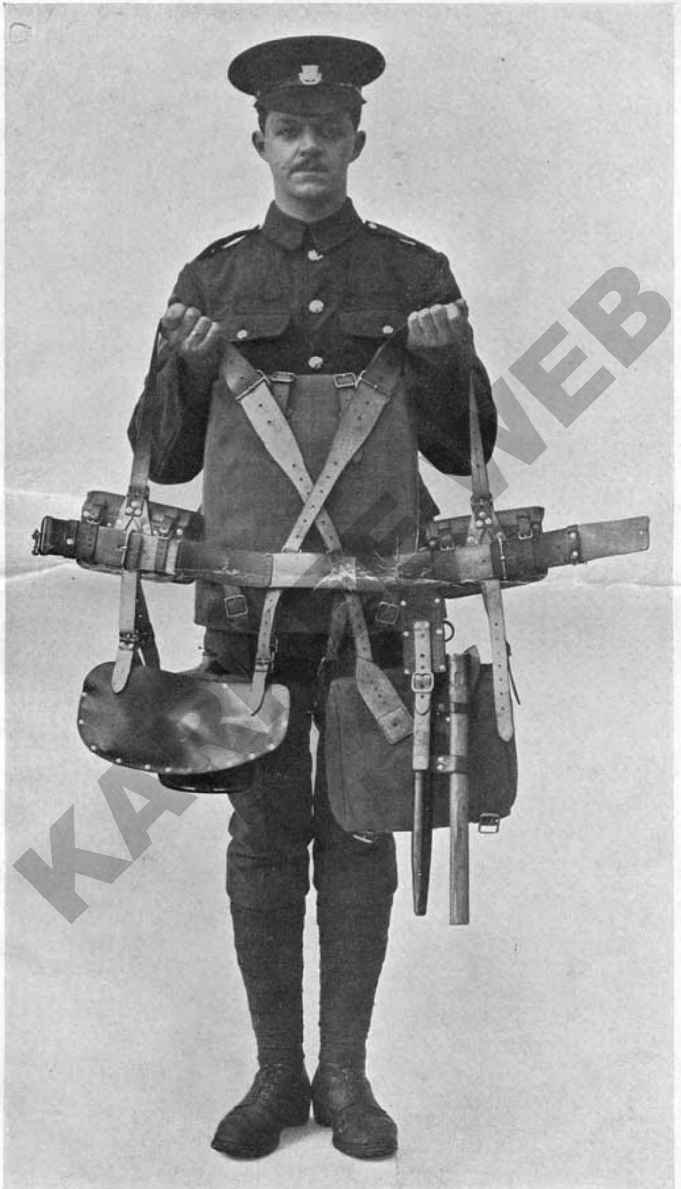
COMPLETE EQUIPMENT ASSEMBLED.