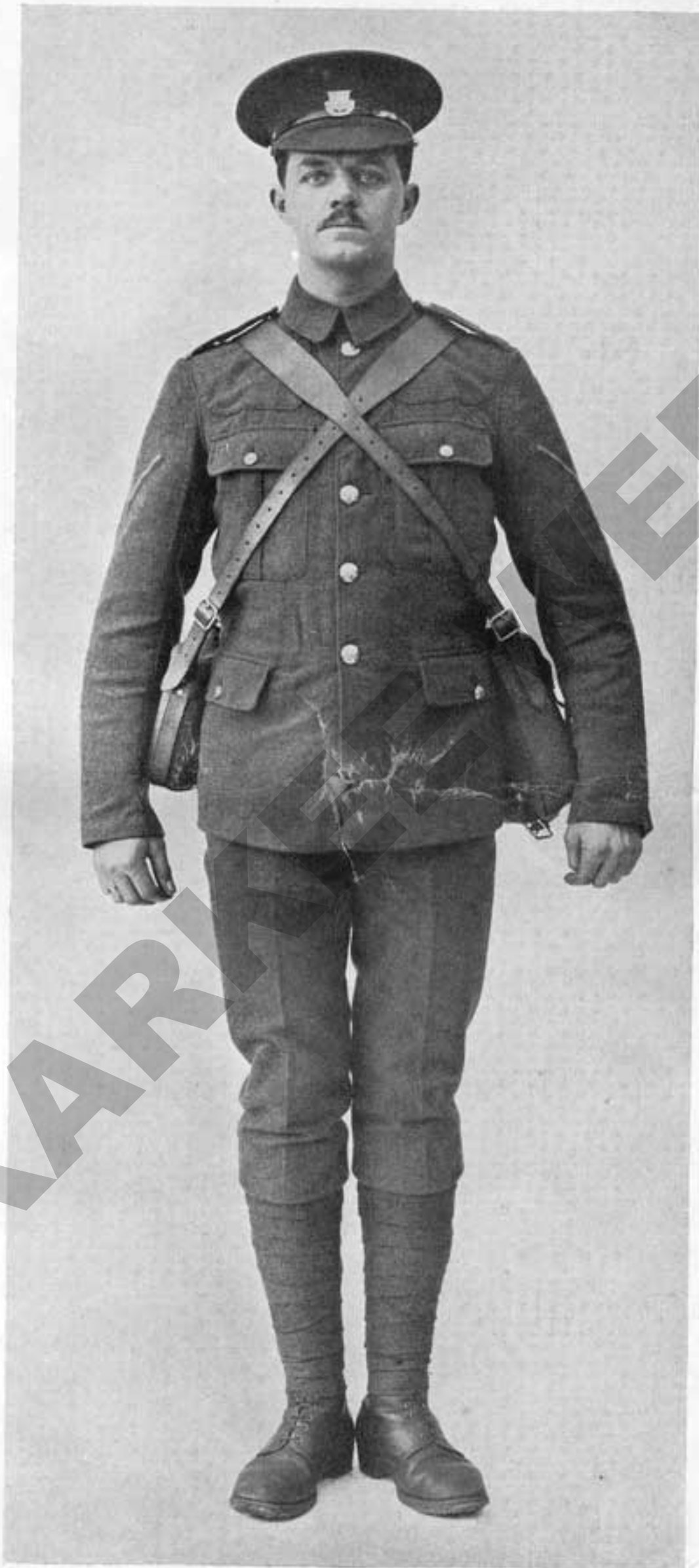
BRACES SEPARATED FROM EQUIPMENT AND ATTACHED TO WATERBOTTLE AND HAVERSACK, SHOWING ORDINARY METHOD OF SLINGING ACROSS THE SHOULDERS.