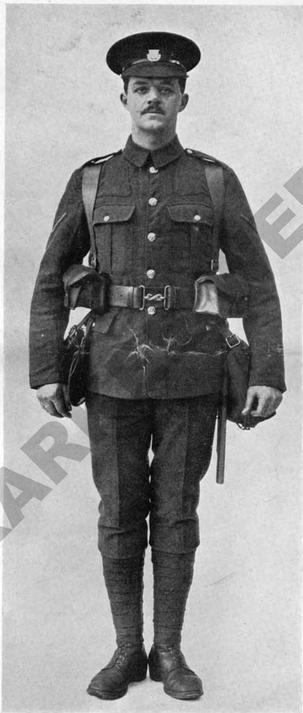
COMPLETE EQUIPMENT. FRONT VIEW.