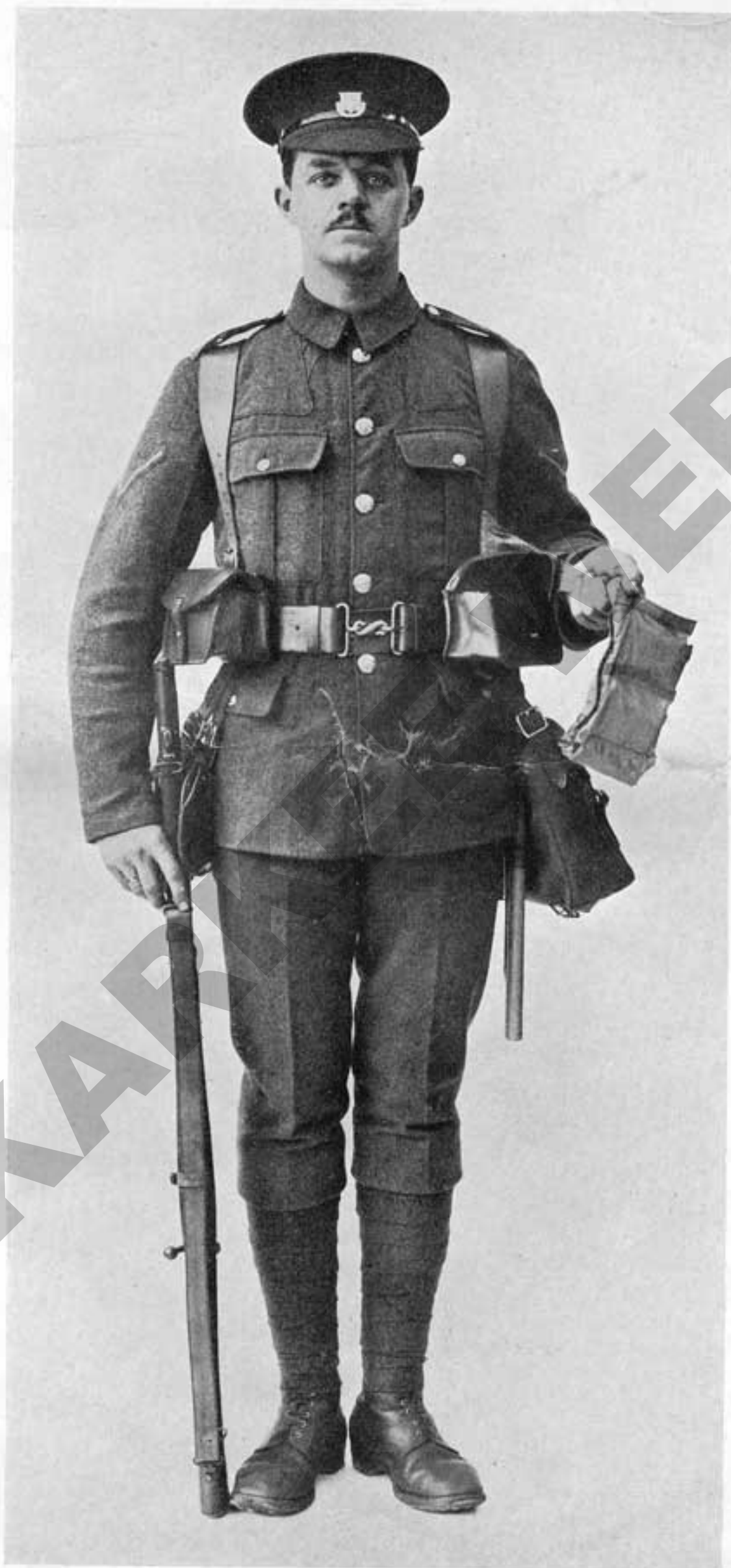
COMPLETE EQUIPMENT, FRONT VIEW, SHOWING COTTON BANDOLIER CONTAINING 50 ROUNDS OF S.A. AMMUNITION.